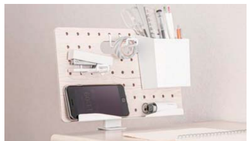
Product jointly developed with Hokkaido Kushiro Konan High School Punching tablet & book stand that can hook stationaries

In 2021, we signed a partnership agreement with Hokkaido, Sapporo City and Hokkaido University, and have been working to develop “Future IT Human Resources” who can use the power of digital technology and data to solve problems in local communities and create the society of the future. As part of this initiative, we are conducting cutting-edge AI research with Hokkaido University. Moreover, a product jointly developed with Hokkaido Kushiro Konan High School in 2024 is sold in stores nationwide. We will continue our efforts with the aim of producing many leaders from Hokkaido, the place of our founding, who will become a bridge to the world.