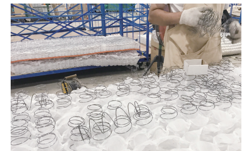
Dismantle discarded bed mattresses and sort metal parts → recycle as resources

For example, at some distribution centers, large furniture and bed mattresses that are difficult to dispose of are dismantled by hand and sorted into metal and scrap materials. These materials are collected by a processor and recycled as resources or solid fuel. In addition, stretch film (packaging wrap) used at distribution centers is collected and recycled by a processor after sorting, and is converted into garbage bags for use as in-house supplies. This contributes to resource recycling within the Group. NITORI Group will continue to strive to establish a disposal flow that makes the most of its unique, integrated business model.